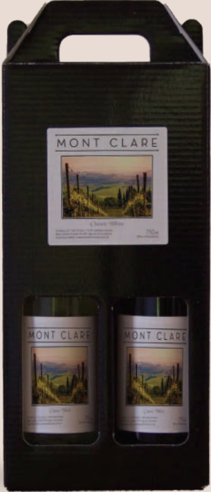
Black Gloss Twin Pack

From $25 + GST (including South West Range wines with your corporate wine labels).