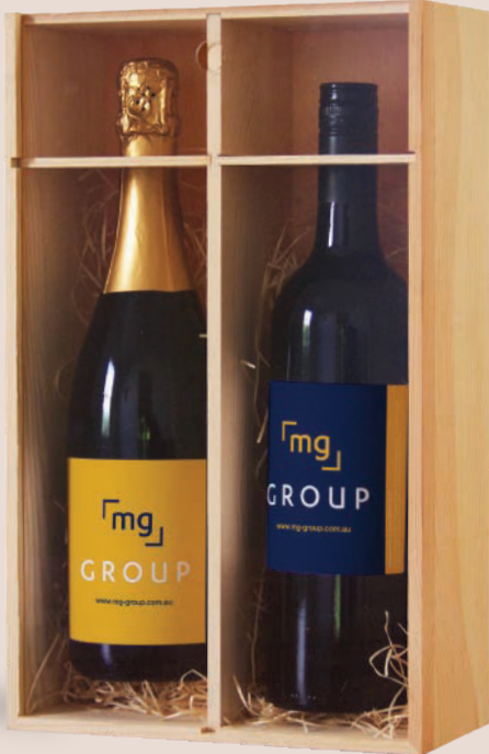
Double Bottle Pine Gift Box

From $15 + GST Per Unit (Including South West Range wines with your corporate wine labels)