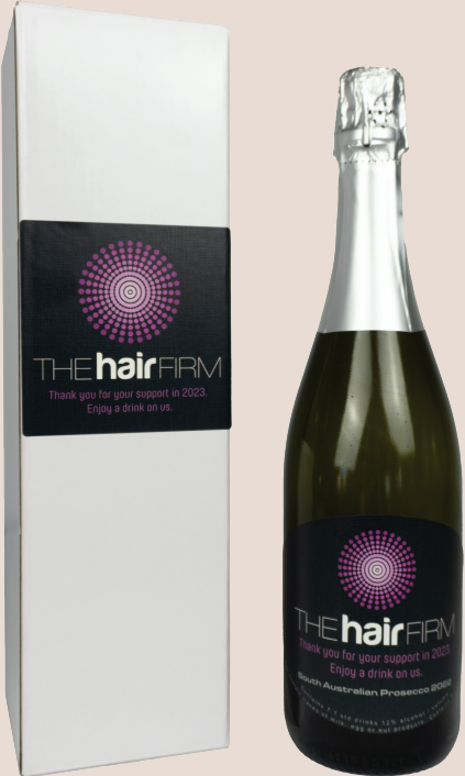
White Gloss Single Box

From - $50 + GST per unit (including South West Range wines with your corporate wine labels)