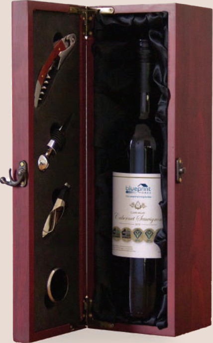
Premium Single Gift Box

From $11.00 Per bottle with minimum purchase of 12 bottles of each selected wine