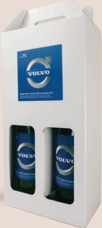
White Gloss Twin Pack

From $65 + GST per unit (including South West Range wines with your corporate wine labels).