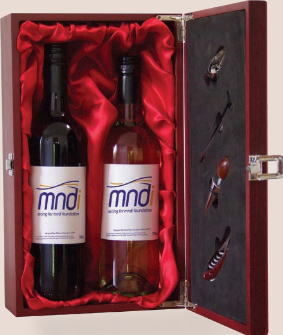
Premium Double Gift Box

From $11.00 Per bottle with minimum purchase of 12 bottles of each selected wine